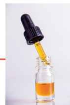
oils, isolate and other finished products