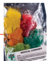
labels and packaging